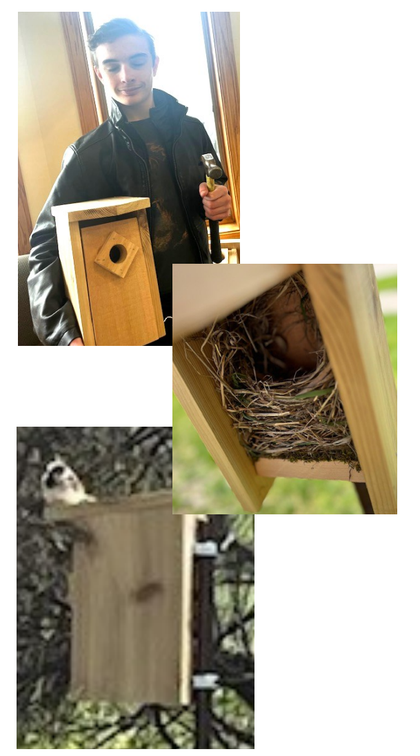
"Even the sparrow finds a home, and the swallow a nest for herself, where she may lay her young." Psalm 84:3:

Check out the bird house log on the bulletin board in the Narthex for updates!