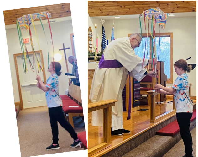
Participating in the worship with Advent symbols.